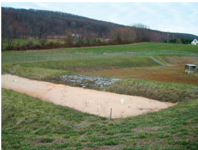
Figure 1. Photograph of filtration practice.

A stormwater filtering practice (FP) treats stormwater runoff by passing it through an engineered filter media consisting of either sand, gravel, organic matter, and/or a proprietary manufactured product, collecting it in an underdrain , and then discharging the effluent to a stormwater conveyance system . FPs are stormwater treatment practices that are often obtained from the marketplace due to unique proprietary technologies (see figure 1).