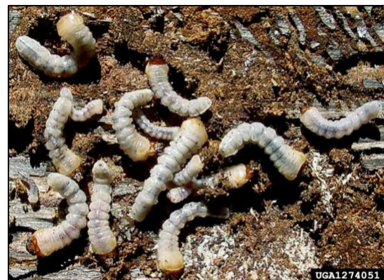
Figure 3. Monochamus spp. beetle larvae.

Coleoptera: Cerambycidae, Monochamus spp.