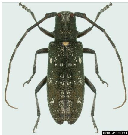
Figure 1. An adult whitespotted sawyer.

Adult pine sawyers are large, cylindrical beetles, often measuring 0.6-1 inch (15-25 mm) long. They are usually colored black, brownish-black, or reddish brown, and are often mottled with patches of white or gray hair (Figs. 1 and 2). The thorax bears a prominent projection on each side. The antennae are remarkably long in the males (Fig. 2).