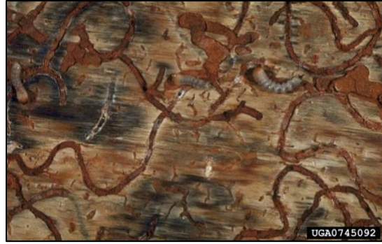
Figure 5. Pine sawyer larva and meandering tunnels under bark.

Properly planted, watered, and fertilized trees maintained in vigorous condition are less likely to be attacked by borers.