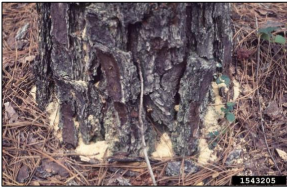
Figure 4. Sawdust-like frass accumulating at the base of a pine tree indicating pine sawyer activity (Jim Baker, North Carolina State University, Bugwood.org).

Adult pine sawyers emerge through nearly characteristic circular emergence holes in the bark of host trees. Adult pine sawyers feed on needles and the tender bark of twigs. Adult females gnaw pits into the bark of dying or recently killed or felled trees and insert one to several eggs in each pit. Upon hatching, the larvae bore beneath the bark and develop for 40-60 days (Fig. 3). Sawdust-like frass may accumulate at the base of a heavily infested tree (Fig. 4). Older larvae make deep tunnels through the sapwood and heartwood (Fig. 5). Maturing larvae return to near the surface to create a pupal cell with an entrance plugged with frass. They overwinter as larvae in this cell and pupate the following spring or early summer, with adult emergence the same year.